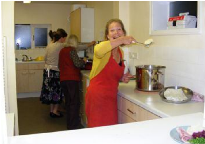
Spuds coming up!