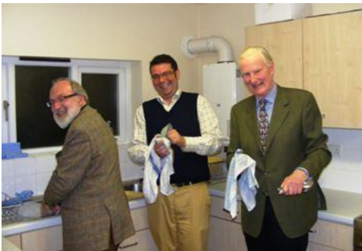
I can't find the instructions!