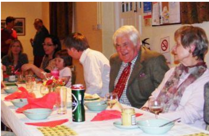
That was a Good One!